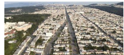
A west to east view of the Geary corridor.

Four SFMTA Muni bus routes currently provide public transit service in the Geary corridor: 38 Geary Local (38), 38 Geary Rapid (38R 4 ), 38 Geary B Express (38BX), and 38 Geary A Express (38AX). Golden Gate Transit, based in Marin County, also operates commuter service into San Francisco via a portion of Geary Boulevard between Park Presidio Boulevard and Webster Street.