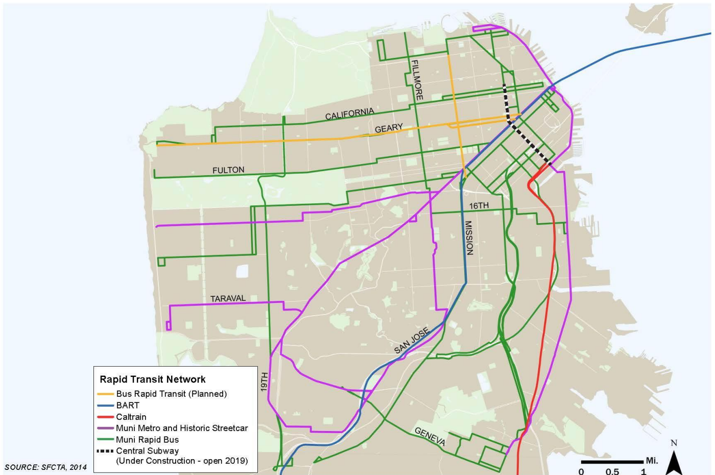
Figure 1-2 San Francisco Rapid Transit Network Map

In 2013, SFCFTA adopted a new version of the long-range, countywide transportation plan, called the San Francisco Transportation Plan (SFTP). It identified four core goal areas, including Livability , Economic Competitiveness , World Class Infrastructure , and Healthy Environment , and reaffirming the importance of the Geary corridor in meeting them by including it in the SFTP Investment Vision.