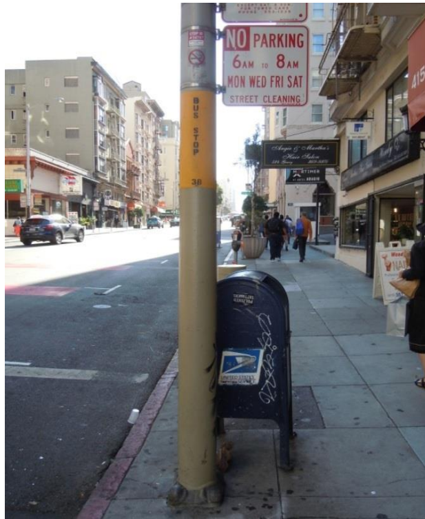
Figure 1-8 Bus Loading Areas

Some stop locations throughout the corridor, like this location in the Tenderloin, feature only a bus stop pole, with no shelter, map, or other amenities.