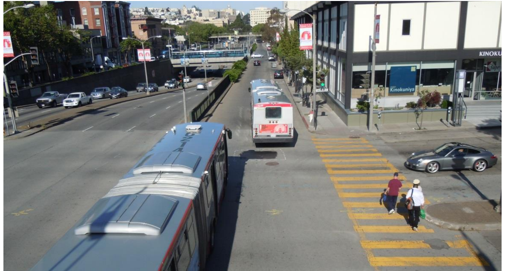
Figure 1-5 Bus Delays and Crowding

Lack of reliability in Geary bus travel times leads to bus bunching, in which buses have been so delayed that they arrive together at a bus stop, such as this one in the Japantown area, instead of at even time intervals, contributing to bus crowding and further delays.