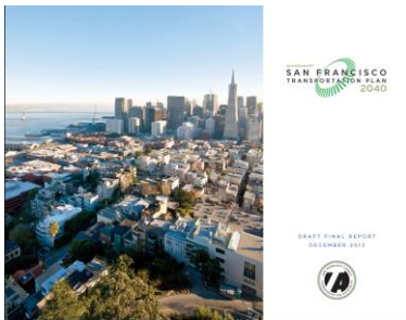
The San Francisco Transportation Plan (2040) includes the Geary corridor in the SFTP Investment Vision.

The CWTP evaluated alternative approaches to meeting the City's rapid transit system needs and recommended a preferred scenario that called for development of a citywide BRT network. Figure 1-2 shows the CWTP's identified rapid transit network. The Proposition K Expenditure Plan, the investment component of the 2004 CWTP approved by voters reauthorizing the City/County's half-cent transportation sales tax measure, featured Geary BRT as one of the named projects to be funded.