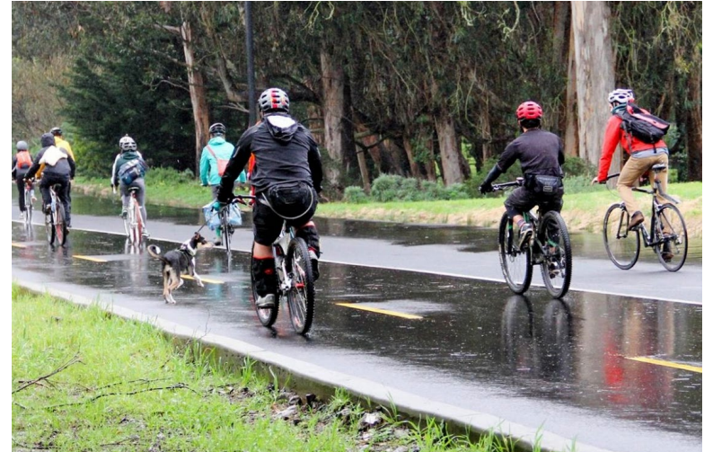
Bike and pedestrian path on Mansell St, McLaren Park