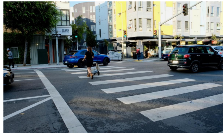
Mid-block crossing 8 th and Natoma