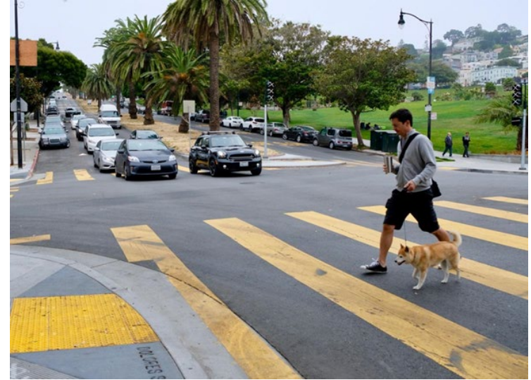
Dolores St Pavement Renovation