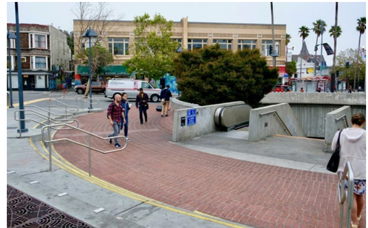
24 th St BART Plaza