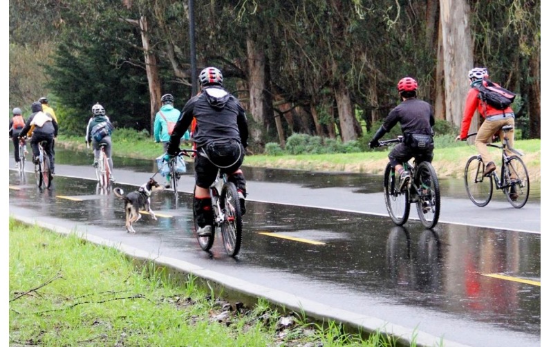
Bike and pedestrian path on Mansell St, McLaren Park