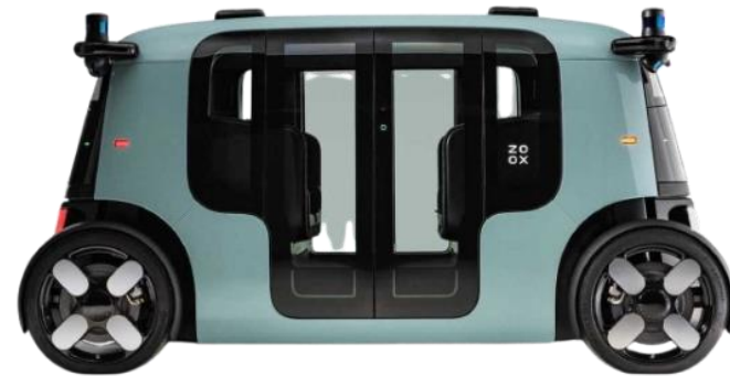
The Zoox purpose-built AV, launched in SF in 11/24