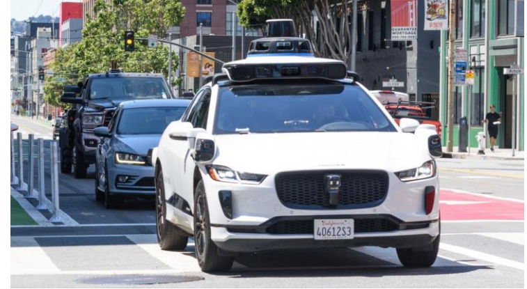
Waymo was the primary AV operator in SF in 2023-24

Driving errors that would be citable violations of the CVC