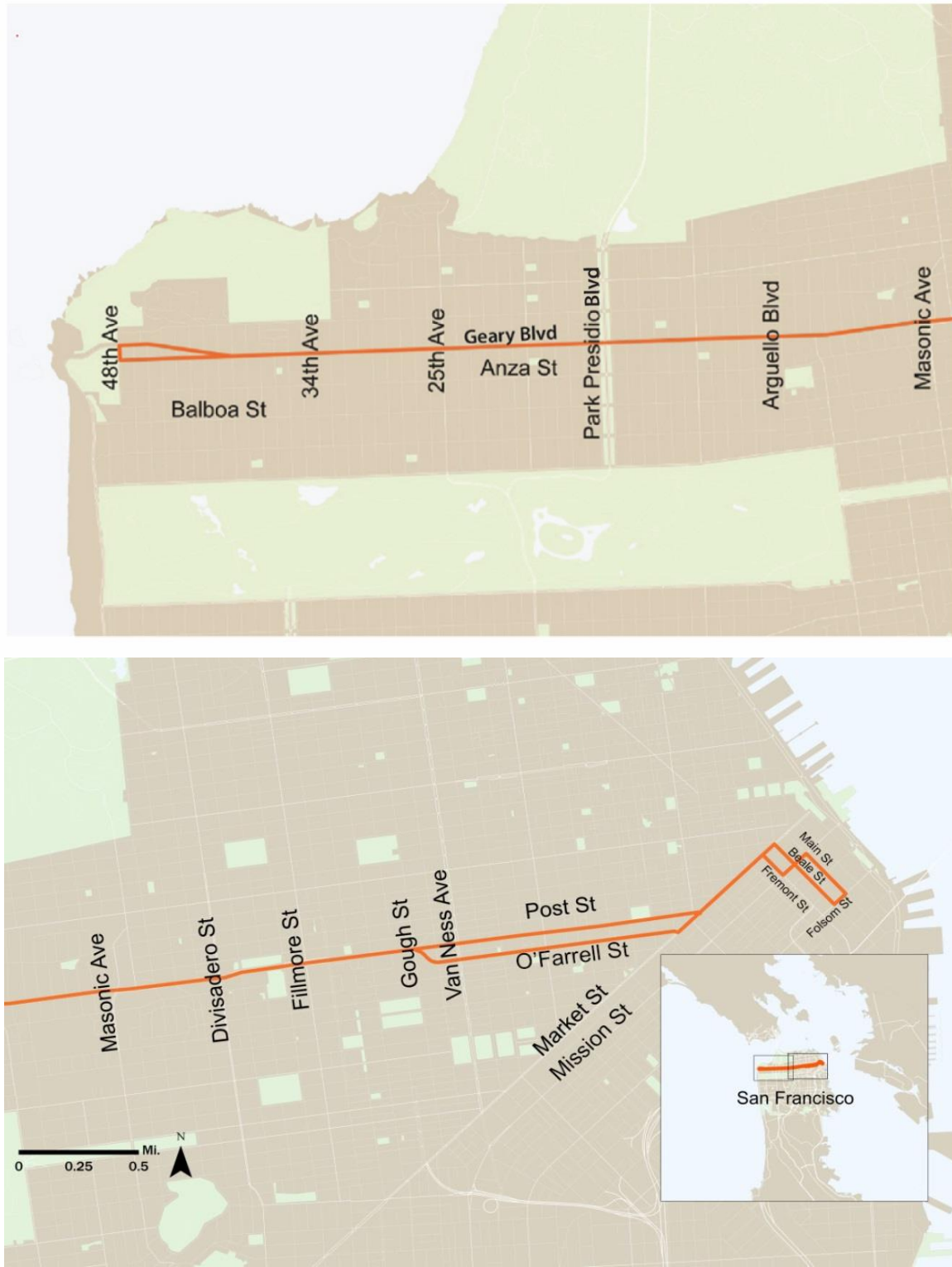
Figure 1-1 Geary Corridor