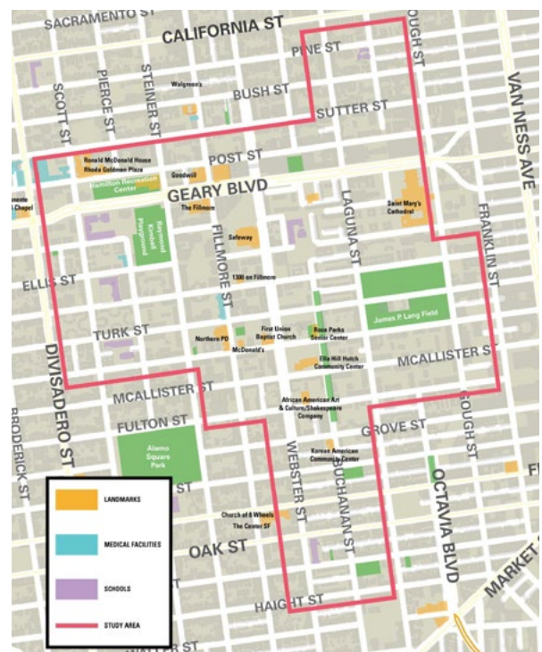
Above: Outreach activities and Project Area for the Western Addition Community-Based Transportation Plan

311 Free language assistance / 免費語言協助 / Ayuda gratis con el idioma / Бесплатная помощь переводчиков / Trợ giúp Thông dịch Miễn phí / Assistance linguistique gratuite / 無料の言語支援 / 무료 언어 지원 / Libreng tulong para sa wikang Tagalog / การช่วยเหลือทาง ด้านภาษาโดยไม่เสียค่าใช้จ่าย / خط المساعدة المجاني على الرقم