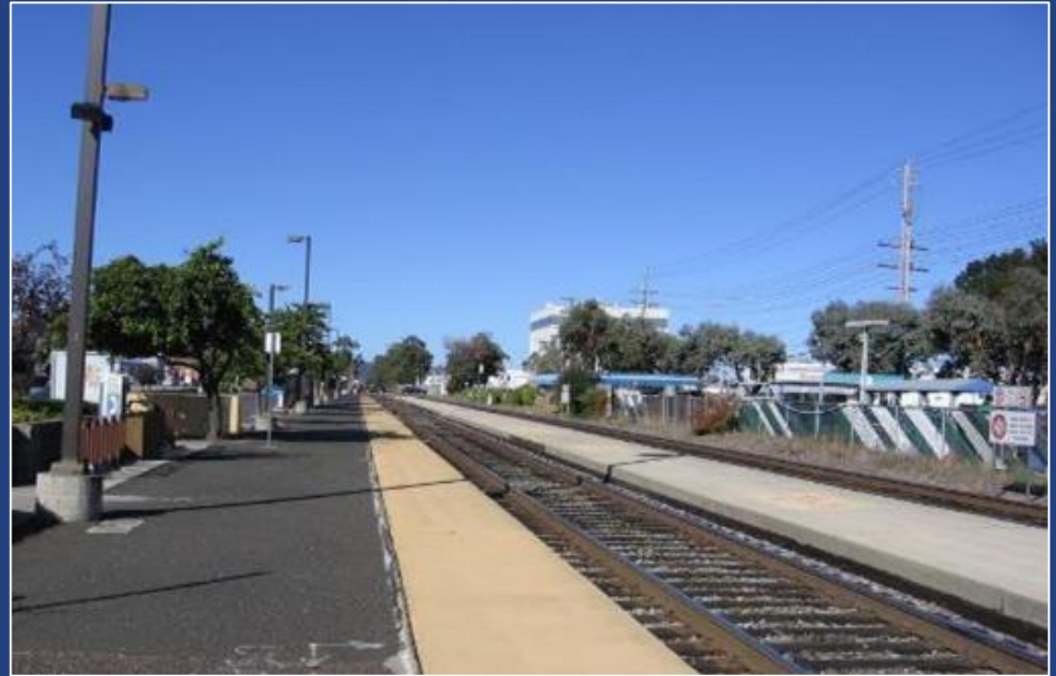
Example of “hold-out rule”