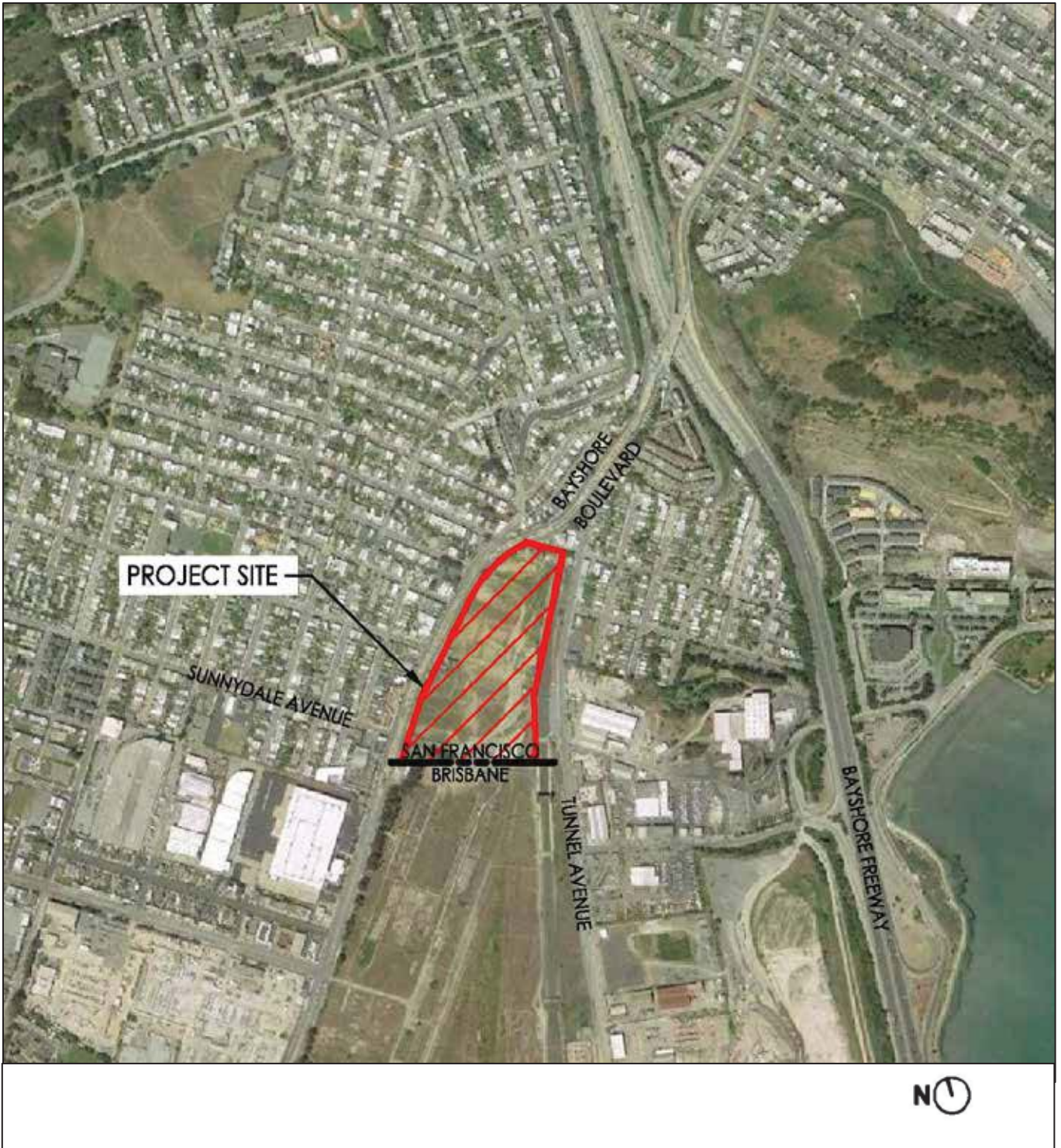
Exhibit A Project Site Diagram