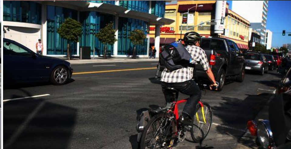
LTS 4 Only "Strong and Fearless" will ride