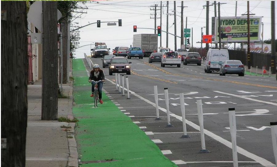
LTS 3 "Enthusied and Confident" will ride