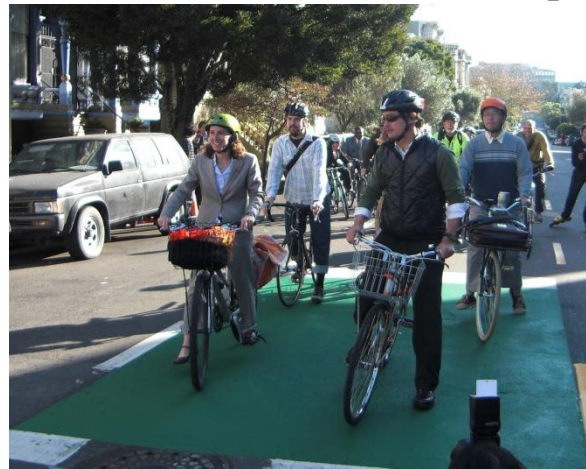
Intersection Treatment for Comfort & Safety