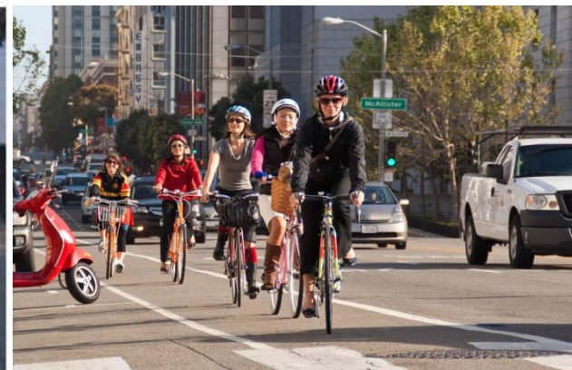
Standard Bicycle Lane