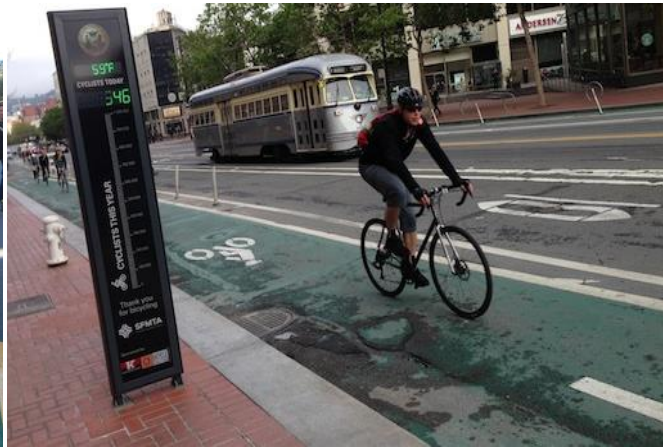
Interim Cycle Track