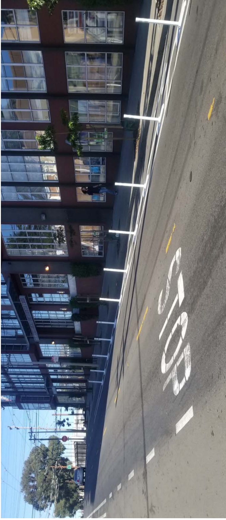
17th Street Delineator Installation