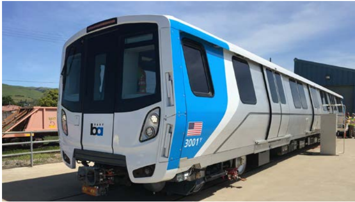
BART Expansion Vehicles