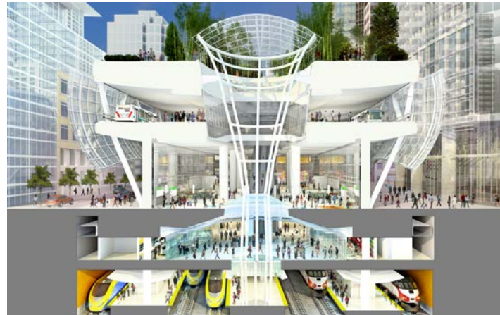
Caltrain/HSR Downtown Extension

Also: Core Capacity transit improvements, regional ferry improvements, Transbay rail crossing (2 nd tube), San Francisco Bay Trail / safe routes to transit, Next generation Clipper, regional express bus and Transbay Transit Center operations