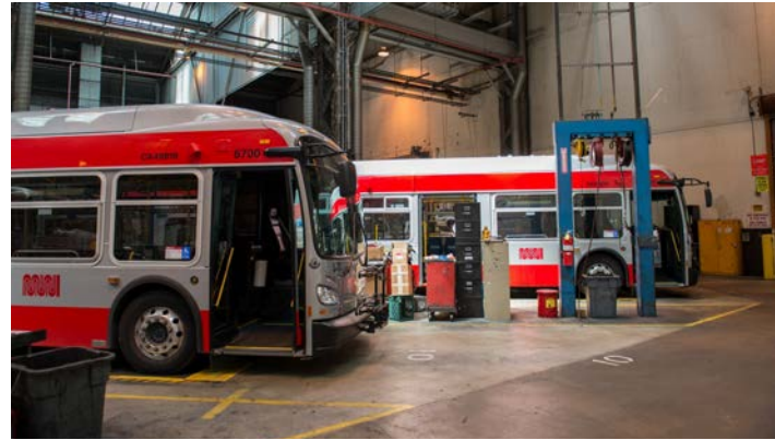
Muni Vehicles and Facilities