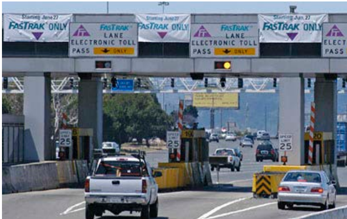
Regional Express Lanes Program