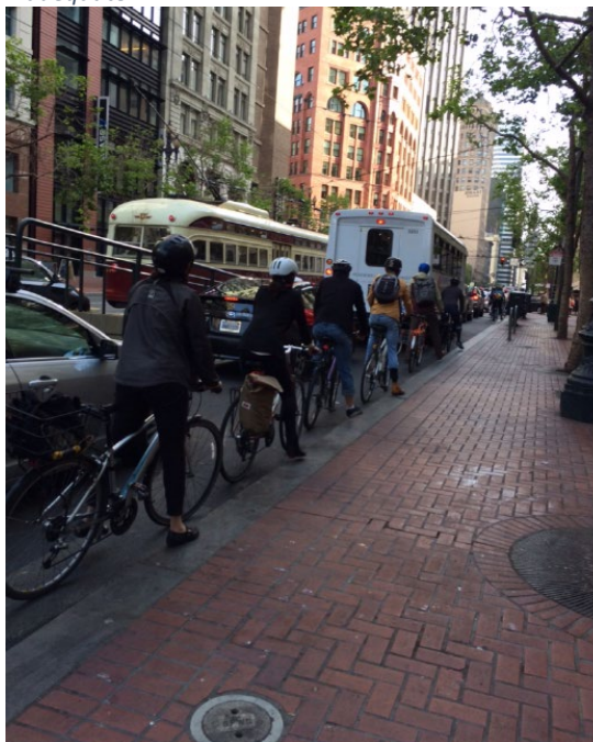
Figure 1: Current Accommodation for Bicycles is Inadequate

The three interdependent elements of the project scope are as follows: