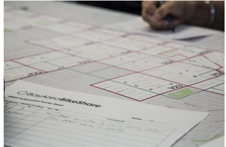
4-6 feasible location options per grid square were presented at public workshops