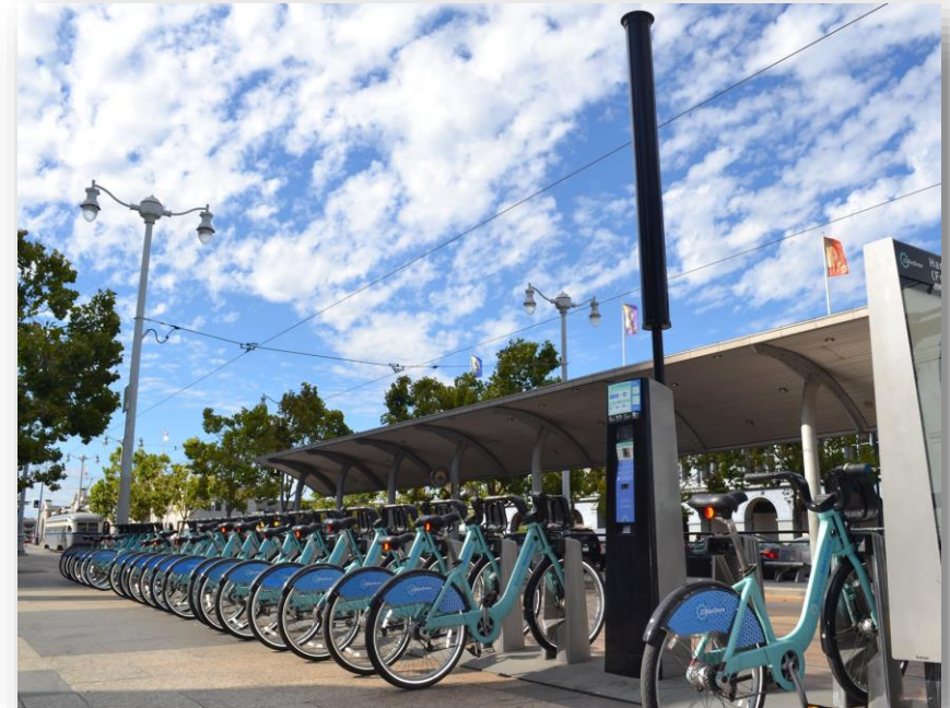
The Bay Area's bike share will be the largest bike share per-capita in the country when expansion is complete