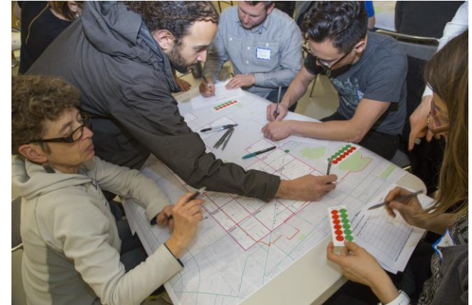
Community members review a map together at a public workshop. Workshops for Phase 1 were held in Districts 6, 8, and 9.