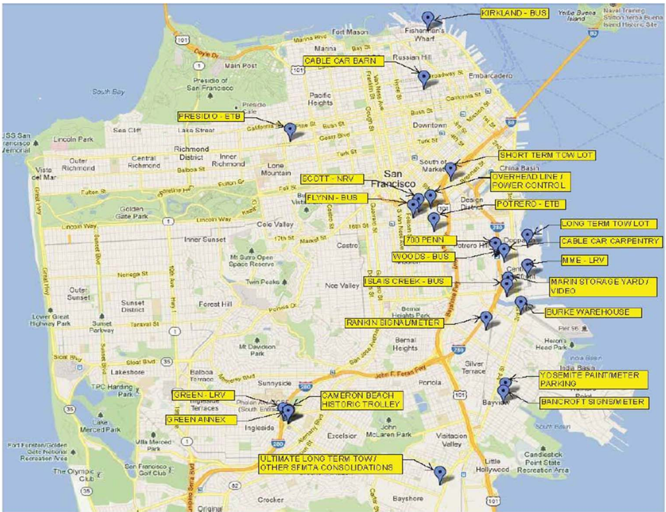
FIGURE 4 – MAP OF FACILITIES LOCATIONS