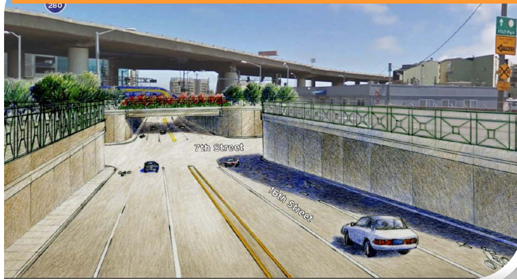
POTENTIAL GRADE-SEPARATION OF 16TH STREET