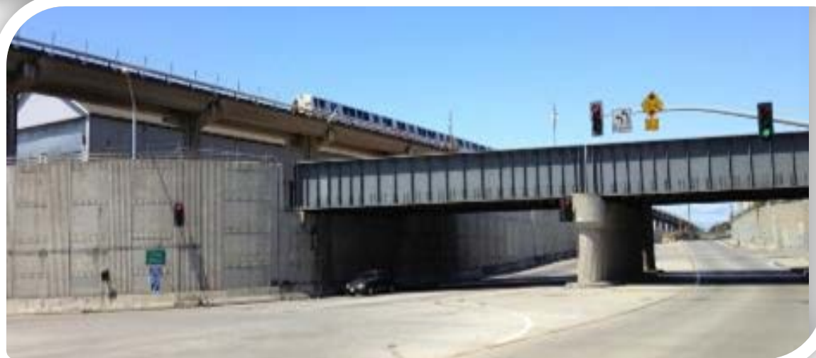
EXISTING GRADE-SEPARATION NEAR WEST OAKLAND BART STATION AT 7TH STREET