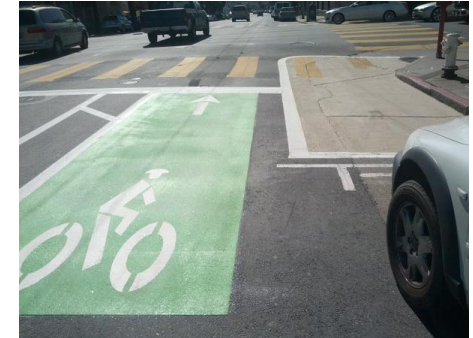
Painted Safety Zone and bicycle enhancement at Howard & 10 th