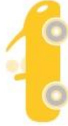
Safe People and Safe Vehicles